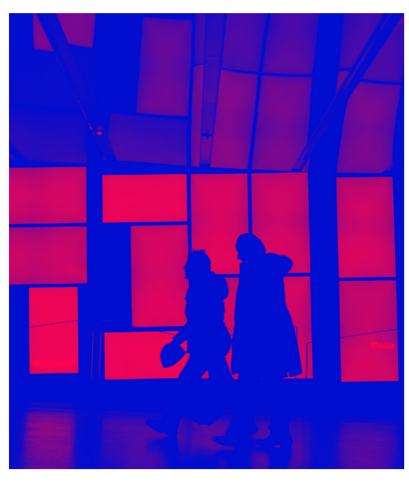
© « Stéphane Querrec, La Complainte, 2016 »

The rich, complex, and fragile ecosystem of cultural creation depends first and foremost on artists and creators. Without the creative heart of Montreal, this international reputation as a creative metropolis would simply not exist. It is therefore crucial to continue and even expand our efforts to support our artists and creators and the City must work to eliminate obstacles to the development of Montreal's creativity which fall within its purview.